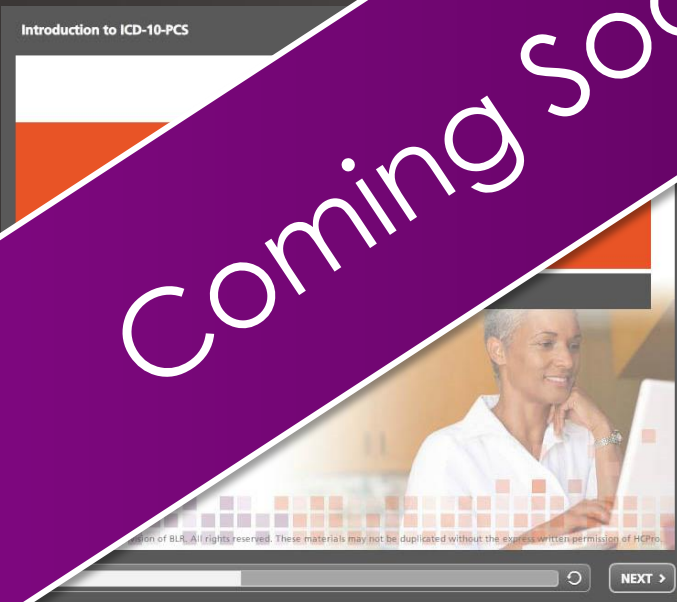
ICD-10-PCS Boot Camp Available September 2016