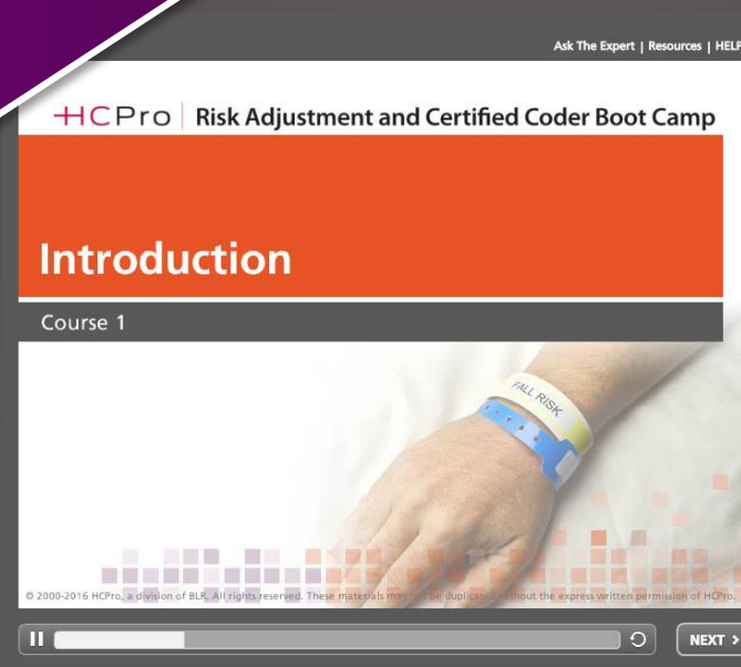
Risk Adjustment Documentation and Coding Boot Camp Available October 2016